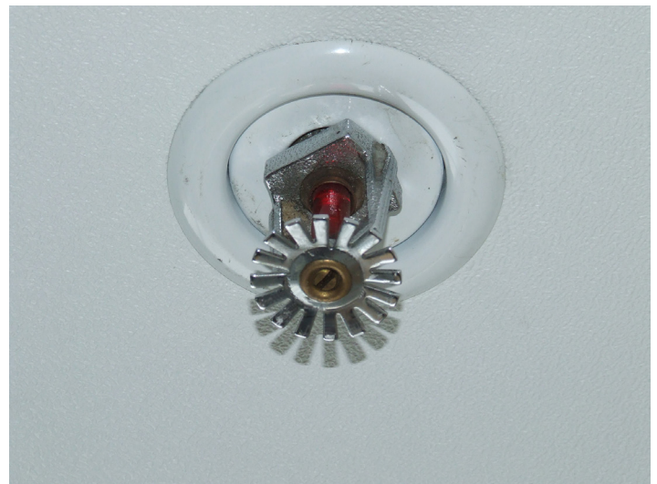
Pendent sprinkler head with glass bulb.

Sprinkler heads can be upright, pendent or side wall. Offices and other areas where there are suspended ceilings will have pendent heads. Often concealed pendent heads are installed flush to the ceiling to provide a smooth appearance. When the surrounding temperature approaches the head's rating, the cover plate will drop off. If the temperature continues to climb, the heads will operate upon reaching the activation temperature.