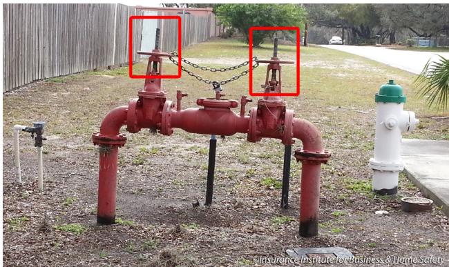
A backflow preventer with two outside screw and yoke (OS&Y) valves is in the open position since the valve stem is visible (highlighted by red boxes). When an OS&Y valve is shut, the stem is not visible.