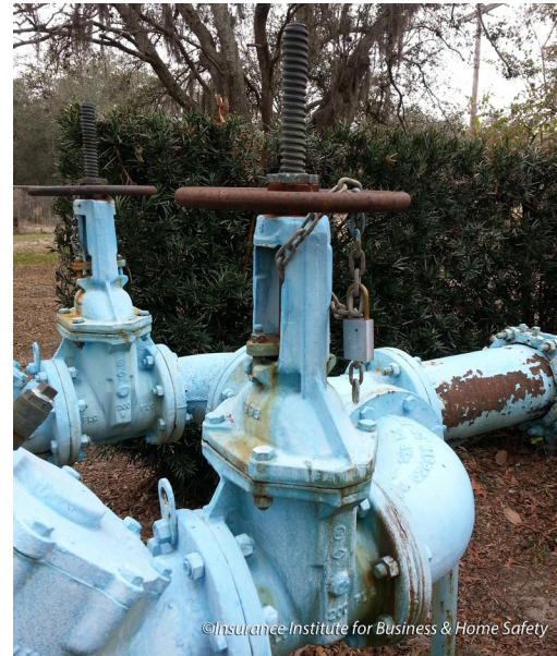
The lock and chain on the backflow preventer pictured above indicates that it is in a locked position.

WHERE IS THE INCOMING MAIN LINE, AND IF THE BACKFLOW PREVENTER IS ABOVE GROUND, IS IT LOCKED?