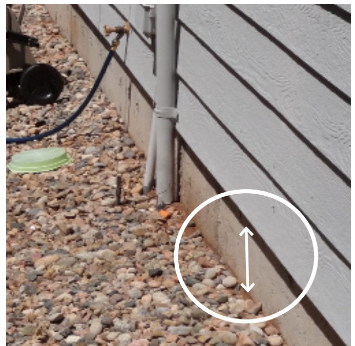
Example of good ground-to-siding clearance.